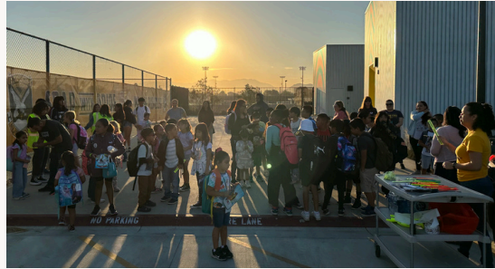
Students and staff gathered at RHS to enjoy the sunrise before walking to school.

Much fun partnering with Rustic Lane for their annual Walk to Schools day