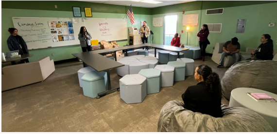
ELAC parents visiting the Wellness Center