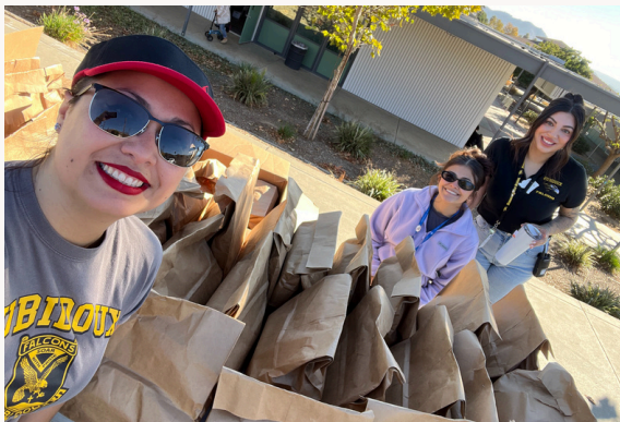
Our wellness center staff at the front of school distributing food bags.

A special thank you to Kidz Come First for donating food items for our 6th Annual Thanksgiving Food Distribution event.