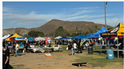
Falcon Festival, hosting all falcons and their families to have a good time.