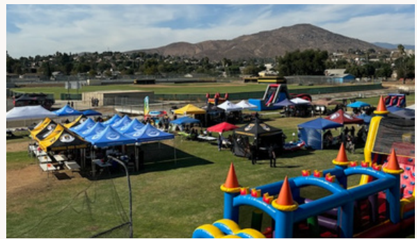
Falcon Festival overview – Getting ready to start the fun!