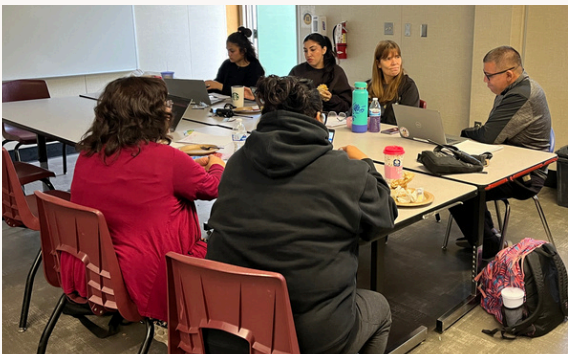
Staff analyzing and synthesizing data

Stay tuned for the school’s one-page report!