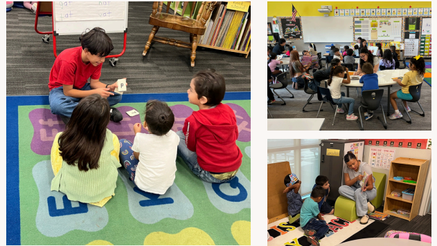
Book Buddies in action at Ina Arbukle

Book Buddies is a program made for students to go to four elementary schools and read to multiple classes. Literacy coaches train our students to ensure that they are comfortable and know what they are doing. We have over 100 students who signed up this year.