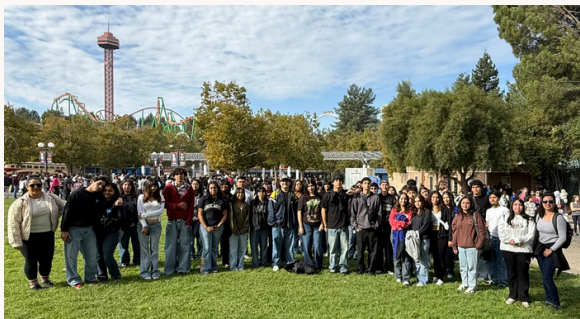
50 falcons celebrating attending to school everyday on time.