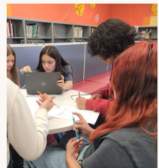
Mathletes helping with tutoring at Mission Middle School