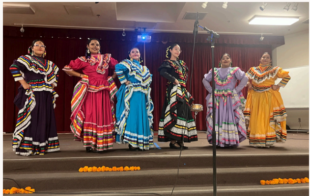
Folklorico group performed for Mira Loma Middle School's Day of the Dead Festival.

Our Folklorico class loves to share with others what they have learned about their culture. Interested in the class? Ask your Guidance Counselor!